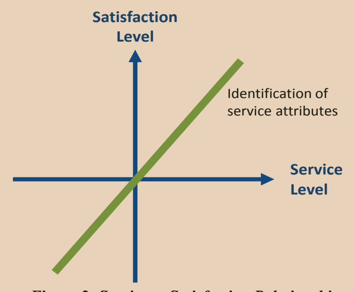
Figure 2: Service to Satisfaction Relationship

Customer experience management resides at the top of the customer experience pyramid. Many companies working on customer management issues already have good systems in place to address