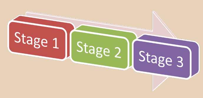
Figure 3: Service Process Mapping

Last but not least, companies working on customer experience enhancement should ensure there is a high degree of alignment of their organizational cultures, employee motivation and reward systems, and at times even the use of technology to achieve this end.